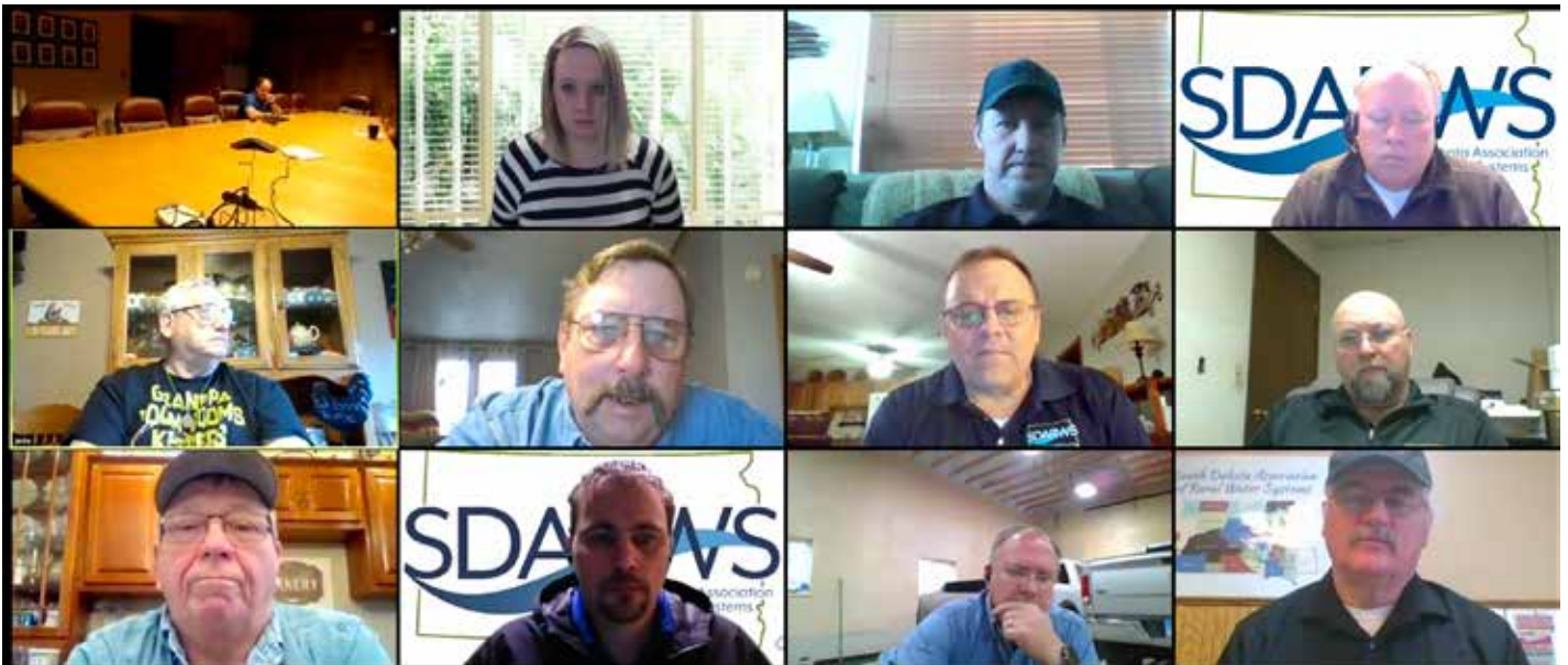
SDARWS staff have been working from home since March 16. Weekly staff meetings have been taking place via Zoom.

The new normal? Maybe it’s wishful thinking from someone who has spent more than 30 years in the industry and is longing to see a reduction in the day-to-day anxiety we experience in our daily toils. Yeah, it may be a pipe dream, but hey, what do you have to lose if you give the new normal a chance to become a better reality!?